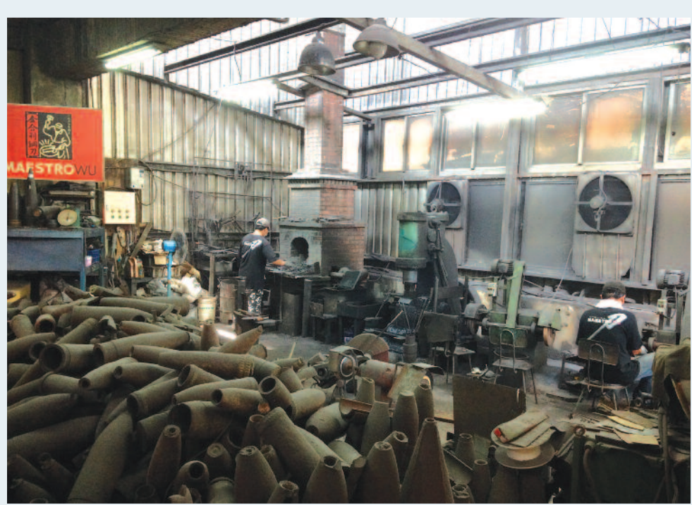
The Maestro Wu factory with its copious supply of steel shells. The WORKER ON THE LEFT IS MELTING A SHELL SECTION IN THE FURNACE, THE STAMP-ING PRESS IS IN THE CENTRE, WHILE ANOTHER WORKER POLISHES A BLADE.

on the beached fishing boats, destroy- back to the beach. There, after discoving most of them and preventing their ering their only means of escape had return to the mainland for the second wave of another 10,000 troops.